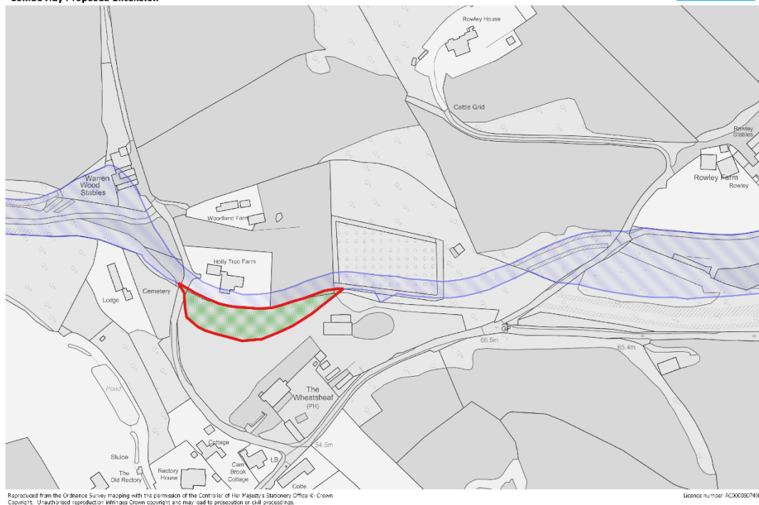
(Figure 70 – Combe Hay)

Following the close of the consultation a total of 61 comments had been received on the above questions and proposed expansions. Comments were divided in support and objection for the amendments. Noted that comments in support cited protection of the heritage asset and benefits of maintaining or restoring the route. Comments in objection primarily cited residential amenity concerns and any restoration impacts which may cause harm to biodiversity. Although not specifically a planning policy matter objections with regards to property value had also been raised.