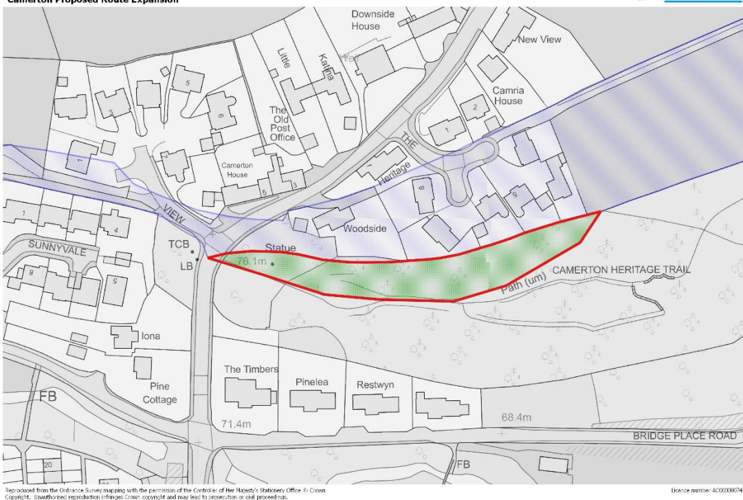
(Figure 67 – Camerton)