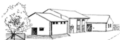
Camerton Community Hall