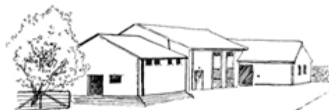
Camerton Community Hall

Wedding, Anniversary, Birthday or regular group meeting?